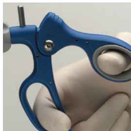
Spread the handle open