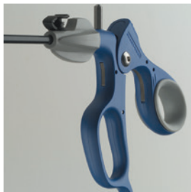
Click to engage handle