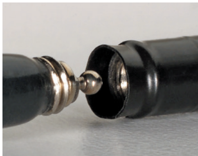
Extended insulation helps prevent the exposure of any conductive metal surfaces

Cost-effective solution with a new blade each surgery