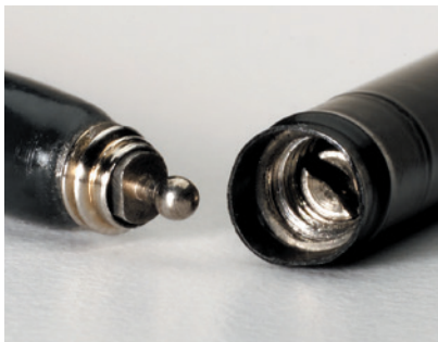
Click-fit tip attachment for easy assembly